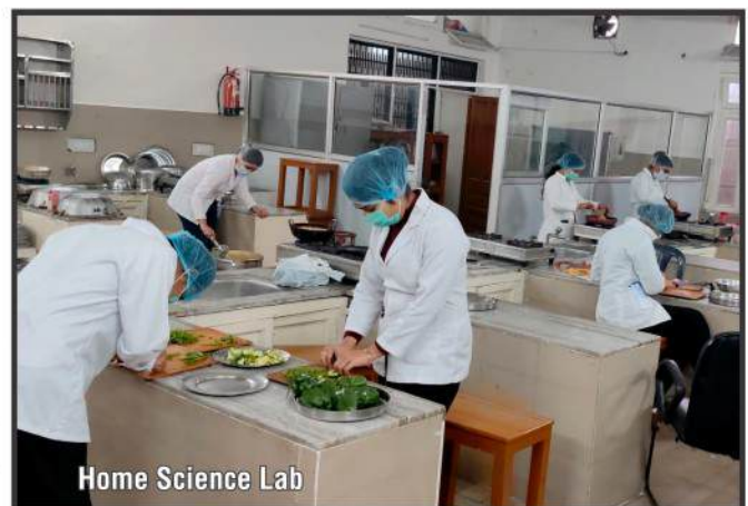
Home Science Lab