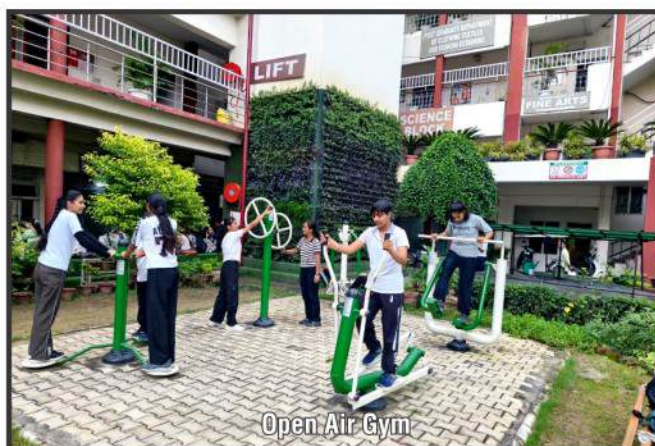
Open Air Gym