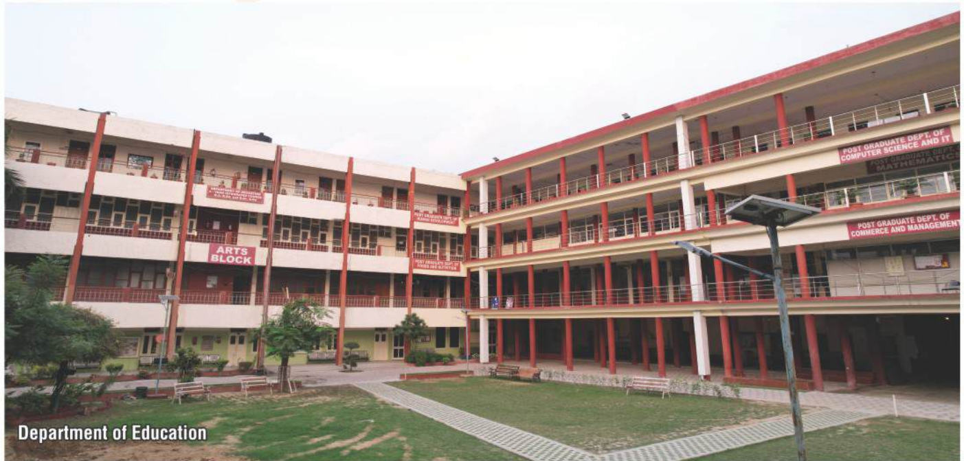
Department of Education