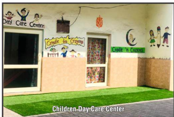
Children-Day Care Center